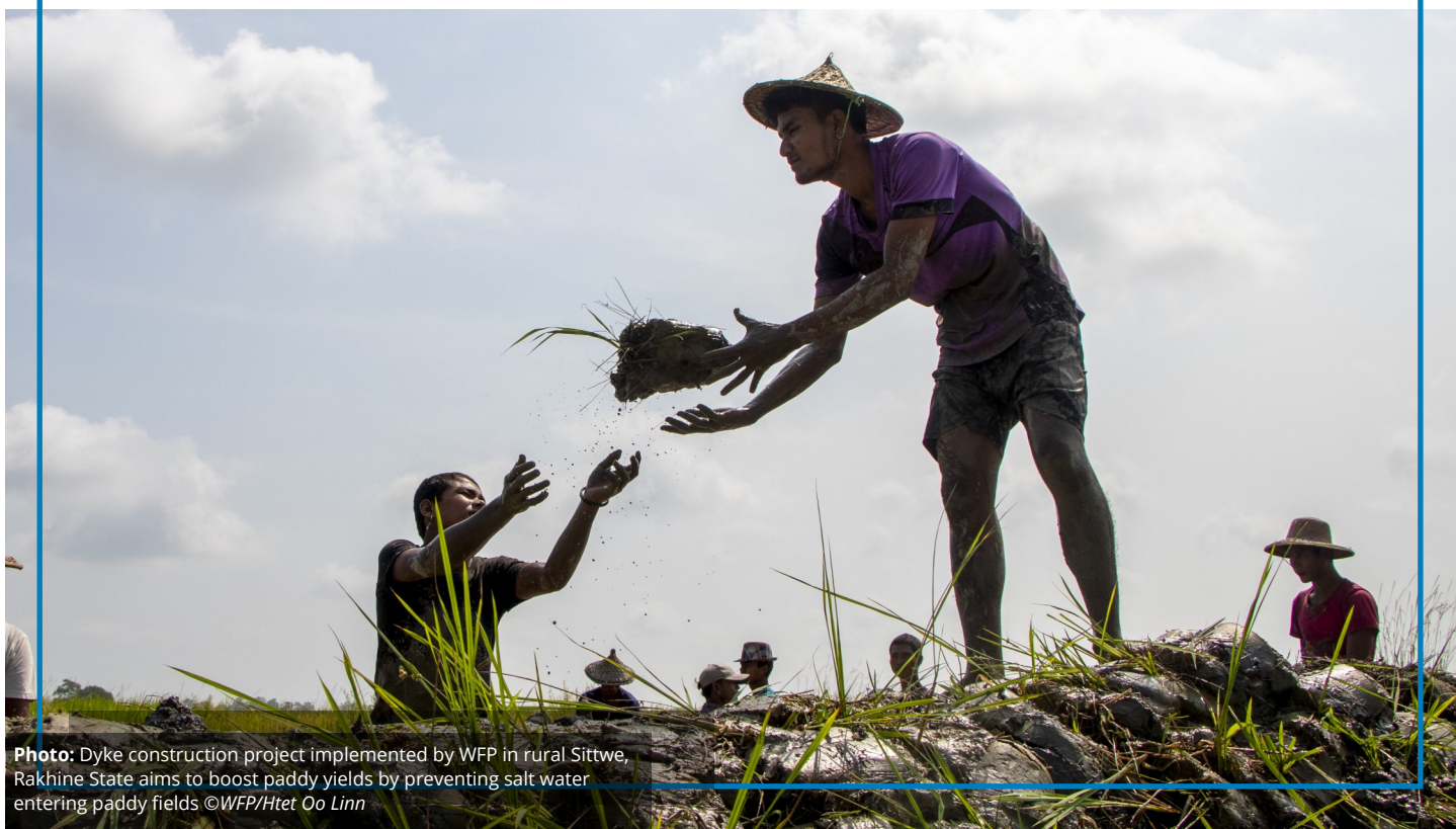
Photo: Dyke construction project implemented by WFP in rural Sittwe, Rakhine State aims to boost paddy yields by preventing salt water entering paddy fields

Australia, Canada, Denmark, Germany, Italy, Japan, New Zealand, Sweden, Switzerland, United States of America, United Nations Central Emergency Response Fund, private donors including Japan Association for WFP, and multilateral donors.